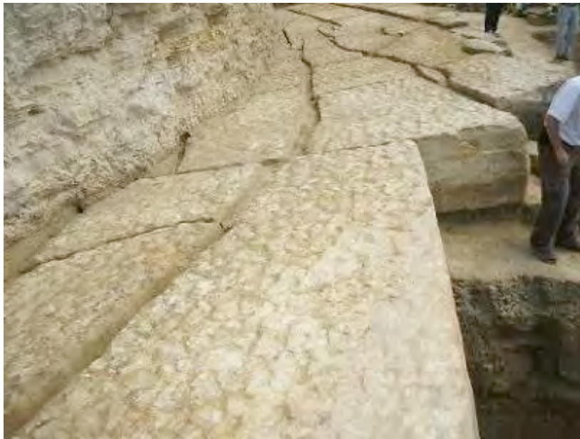
Two-layer stone blocks form one of the terraces in the middle of the “tumulus”