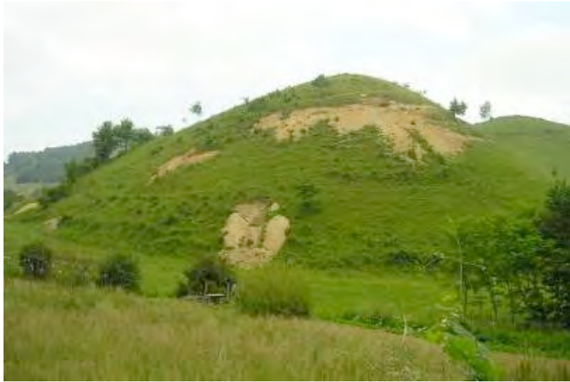
Rounded hill – “tumulus”, 4 km away from the pyramids, 55 meters high