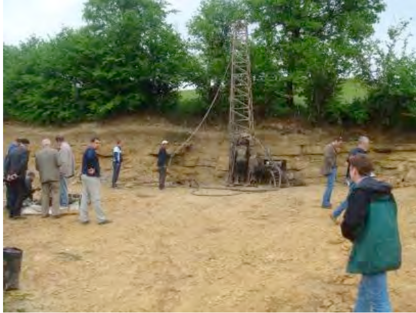
Geological core drilling in summer of 2008